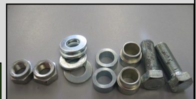
06.7311 Centre Stand Mounting Kit, Commando 71-on

Order on-line: www.andover-norton.co.uk tel: 01264 359 565 email: office@andover-norton.co.uk